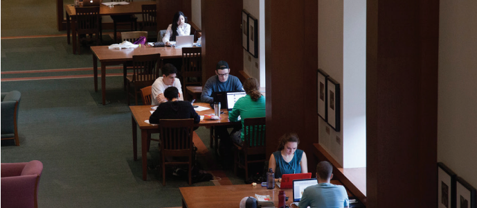
DePaul University Library Snapshot Day | March 8th, 2016

We captured images from the Loop and Lincoln Park Library on March 8, 2016 for Library Snapshot Day.