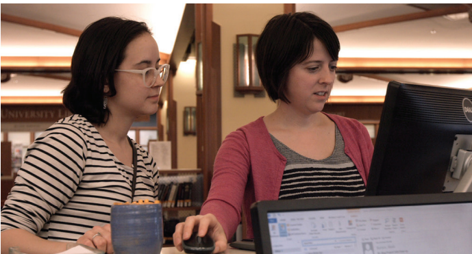
154 questions were answered at the Research Help Desks by reference librarians and peer research tutors.