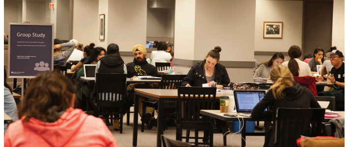
There were 109 study space reservations totaling 195 hours.