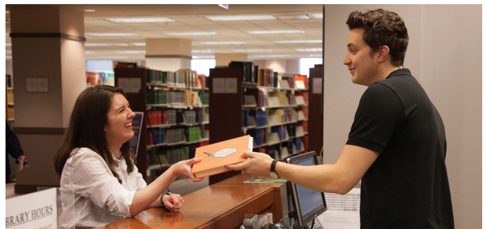
Patrons checked out 410 items such as books, DVDs, chargers, and video games.