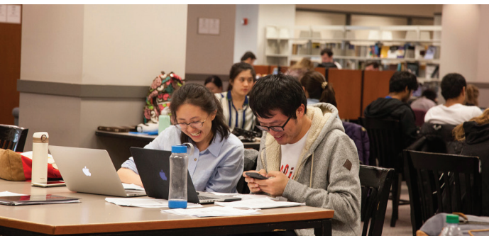
The busiest hour of the day was 3-4pm with 699 visitors between the Richardson and Loop Libraries.