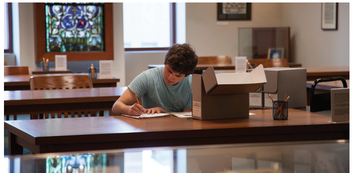
4 researchers spent a combined 10 hours and 25 minutes in the Special Collections and Archives Reading Room working with primary and archival materials.